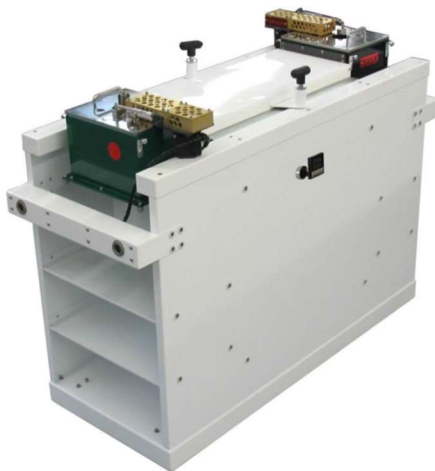
Solder pot exchange cart with two solder pots in place

Overview. The Solder Pot Exchange and Service Cart can be used for servicing solder pots or for rapid exchange of solder pots with different solder alloys. Solder pots are exchanged while hot, but the solder is not molten to avoid solder spills and minimize machine downtime. The actual exchange time is approximately ten minutes when changing between various solder alloys.