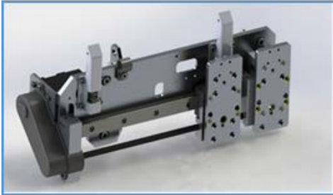
Dual-Simultaneous Programmable Pitch